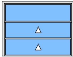
Window with two sliding sections