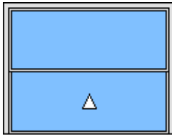
Window with one sliding section